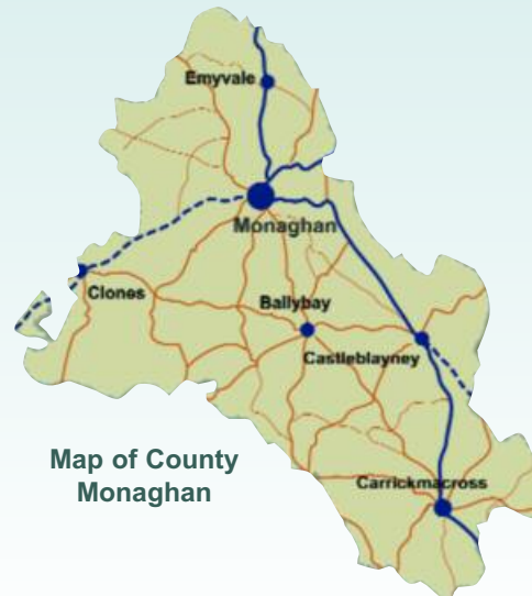
Map of County Monaghan